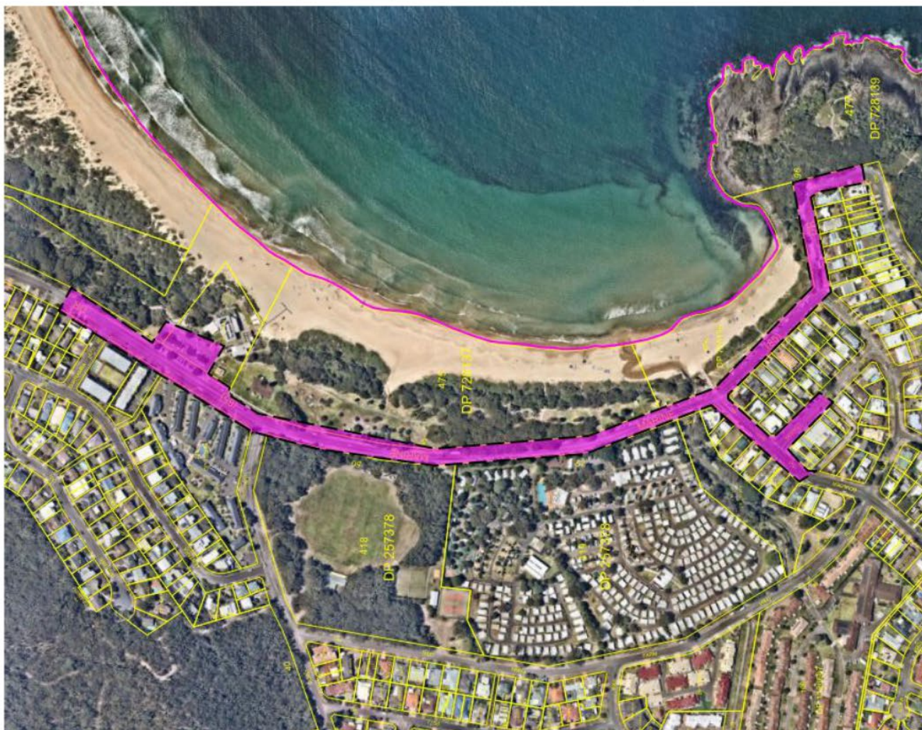
Fingal Bay Smart Parking Extents