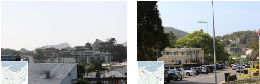
Figure 4. Viewpoint 3 and 4 obtained from Nelson Bay West precinct and Laman Street (left to right)

On this basis, the Clause 4.6 Variation report demonstrates the development will have appropriate horizontal proportions compared to its height with respect to the site constraints, and when viewed from the street elevation and broader locality will present a building width that is consistent with the intent of the standard.