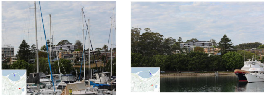
Figure 3. Viewpoint 1 and 2 obtained from Nelson Bay Marina (left to right)

and north-east portion of Nelson Bay Marina looking south, Laman Street looking south-east and from across the Nelson Bay Town Centre looking east. As depicted in Viewpoints 1 and 2 below, the northern elevation of the building presents to the waterway as a contemporary built form with a mix of glazing and light painted render, with an articulated façade that includes a central recess that breaks-up the density of the built form when viewed from the waterway. Furthermore, at Viewpoints 3 and 4 the proposal presents an acceptable scale being of a narrow silhouette that does not dominate the skyline or restrict views of Tomaree Mountain. Across all viewpoints, these photomontages demonstrate that the building will be appropriately screened by the urban form and tree canopy of the Nelson Bay Centre locality, whilst presenting a well-articulated and horizontally proportioned built form.