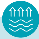
Figure 4: Determine the assessment pathway

Is the development located on flood prone land or within the flood planning area identified on a Council flood certificate or planning certificate ?