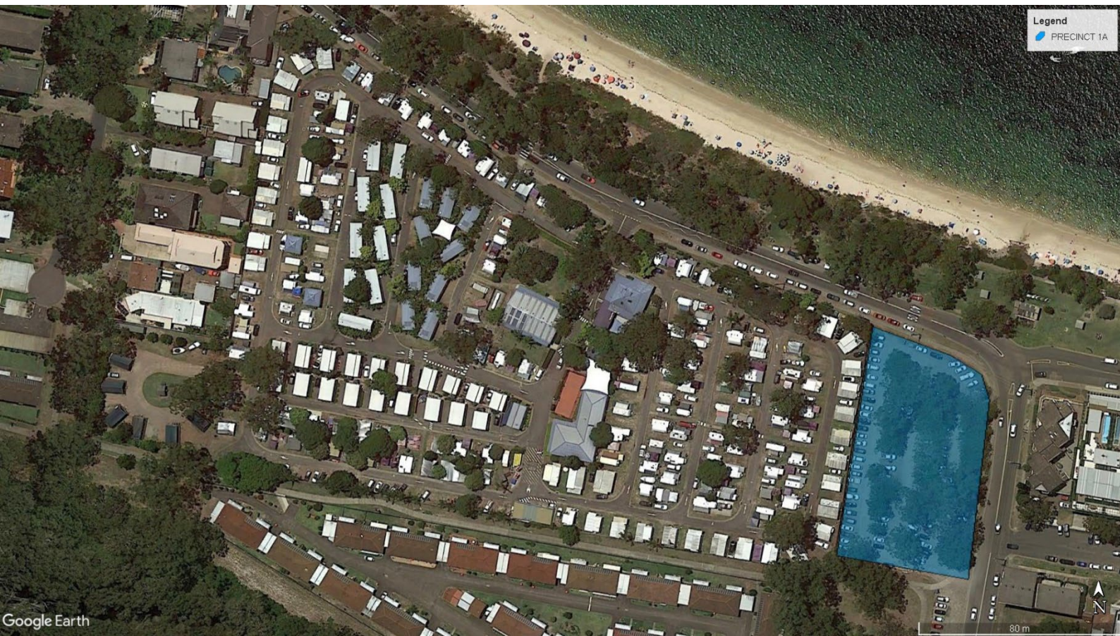
Figure 6: Precinct 1A – Shoal Bay Holiday Park