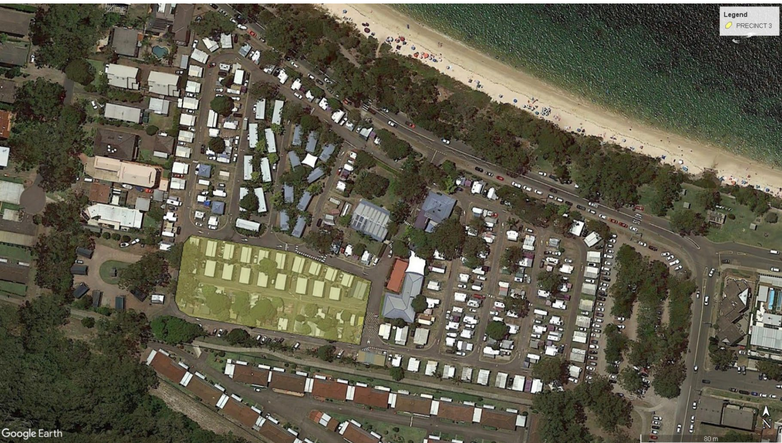
Figure 9: Precinct 3 – Shoal Bay Holiday Park