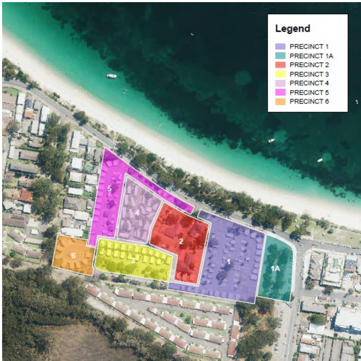
Figure 5: Overview of Shoal Bay Holiday Park's Precincts

The seven precincts are detailed in the below site map: