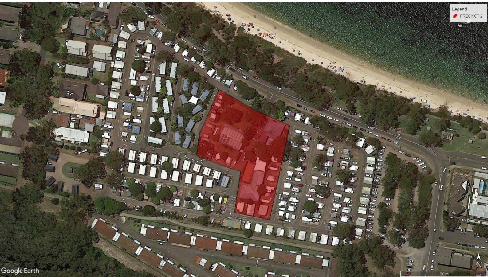
Figure 8: Precinct 2 – Shoal Bay Holiday Park