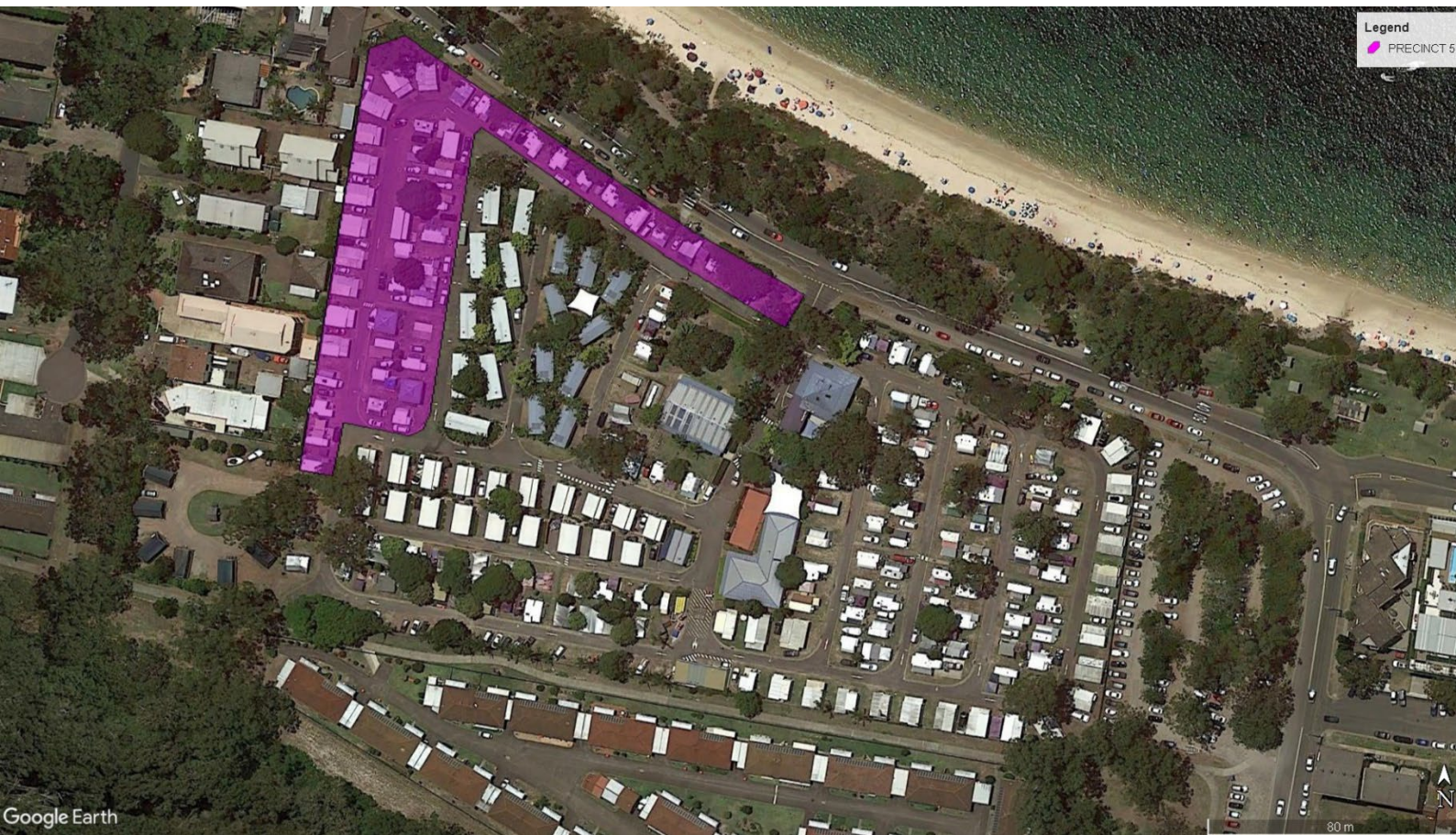
Figure 11: Precinct 5 – Shoal Bay Holiday Park