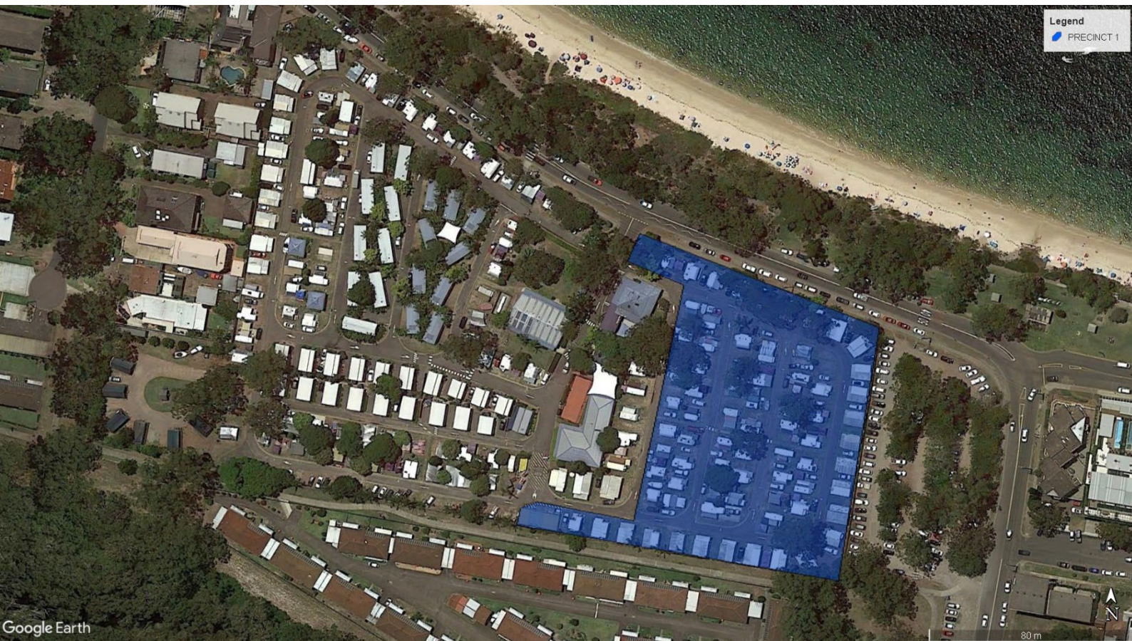
Figure 7: Precinct 1 – Shoal Bay Holiday Park