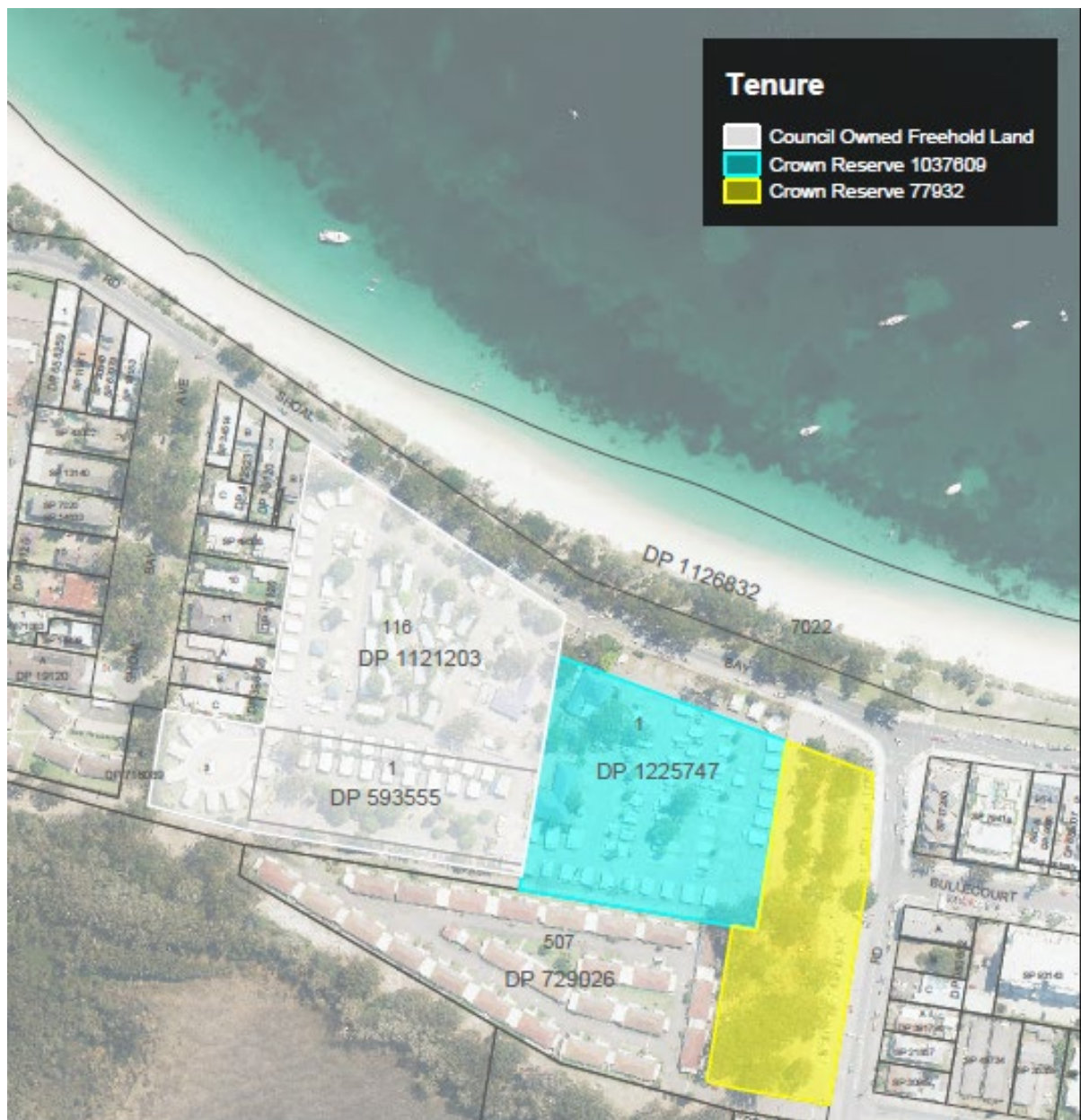
Figure 3: Land tenures