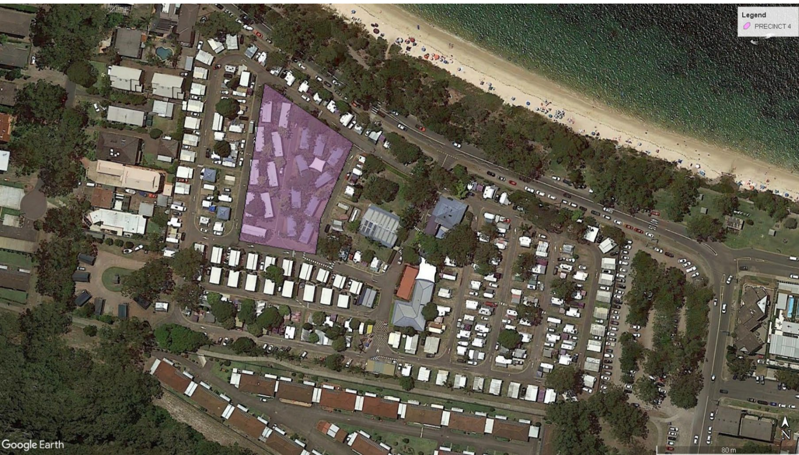
Figure 10: Precinct 4 – Shoal Bay Holiday Park