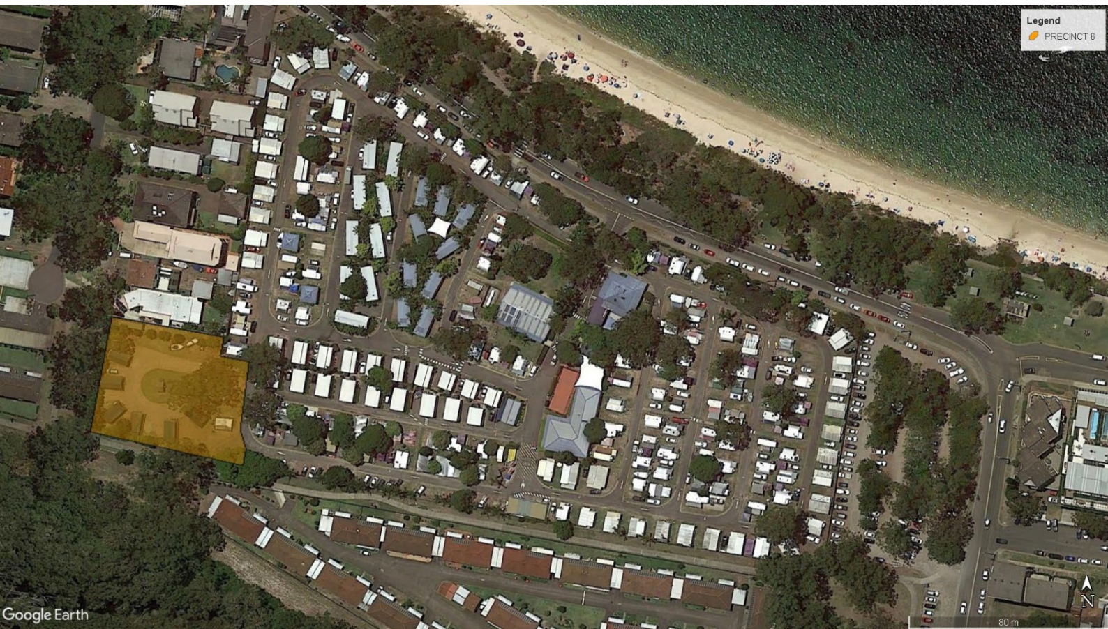
Figure 12: Precinct 6 – Shoal Bay Holiday Park