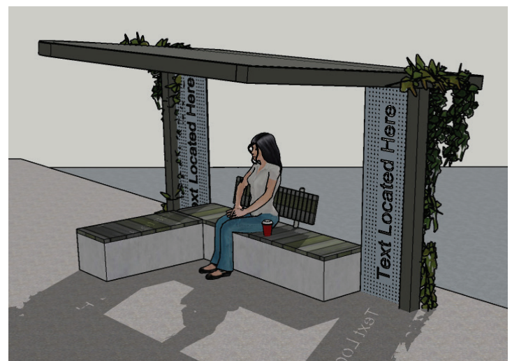
Artists impression: New canopy seating structures for William Street stage 2 works

As part of these works, there'll be 5 canopy seating structures, featuring laser cut elements. These will be installed along the southern side of William Street (the opposite side to Marketplace entrance). We'll also be installing an entry feature at the roundabout approaching William Street from the east. Some street furniture will also be relocated to make the street more accessible.