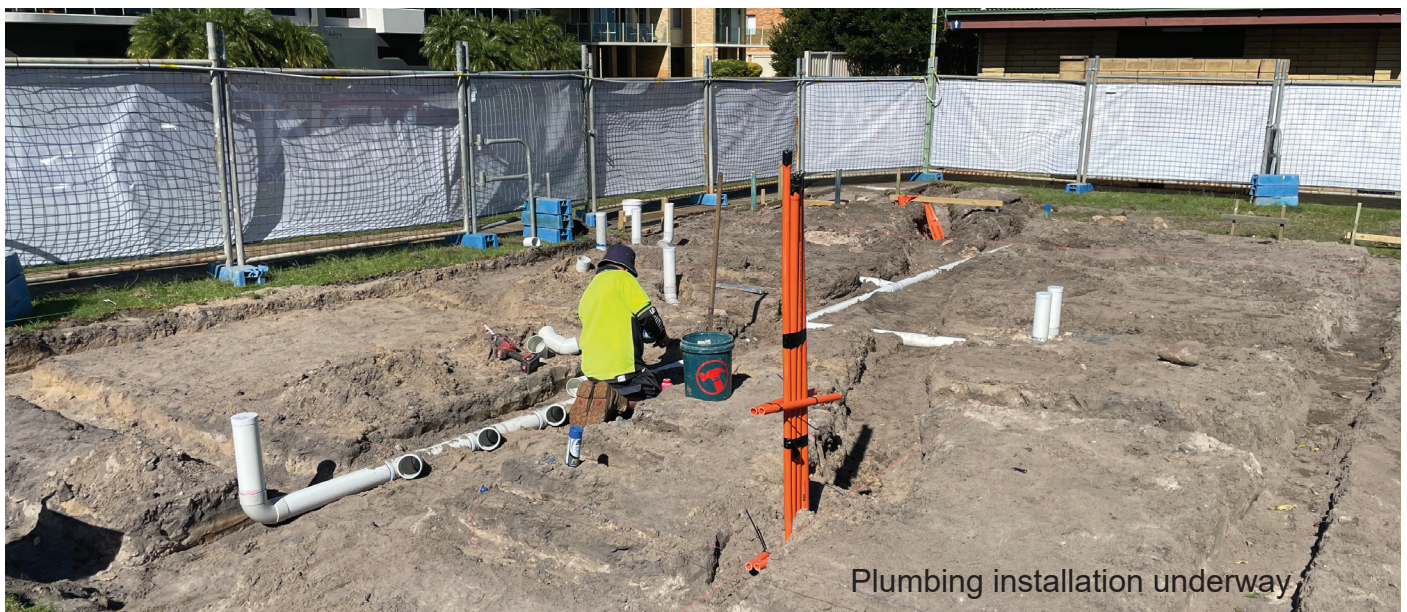
Plumbing installation underway

To learn more about 'Changing Places' go here: changingplaces.org.au