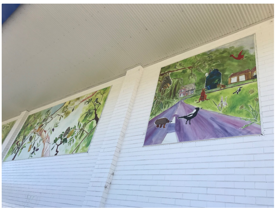
Pictured: Vinyl printed banners inserted into sail tracks