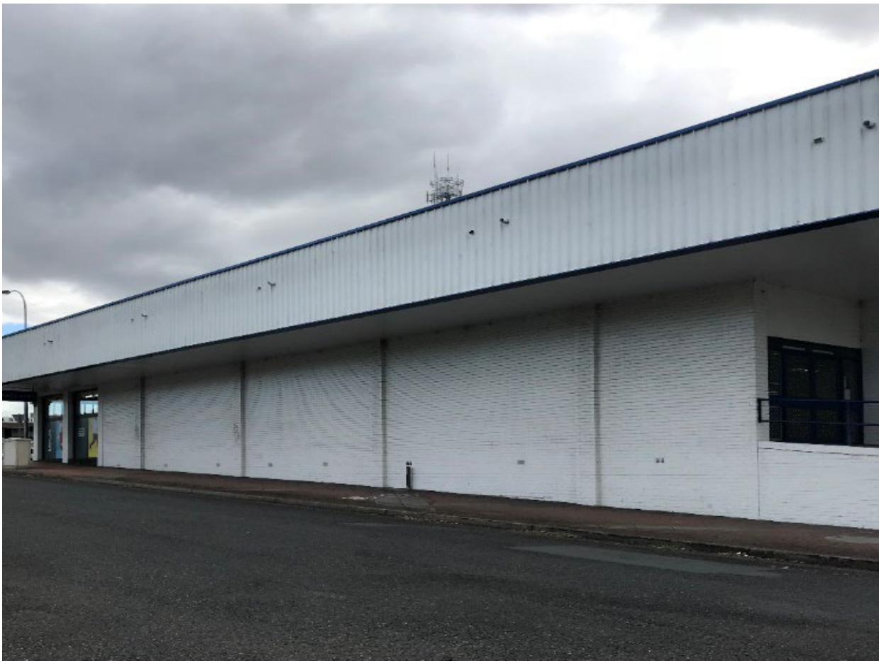
Pictured: Before artwork installation