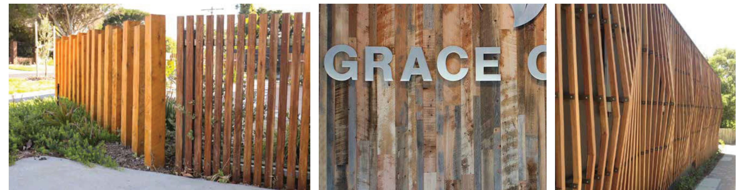
Timber upright posts to provide a permeable visual screen and allow for the mounting of lettering.