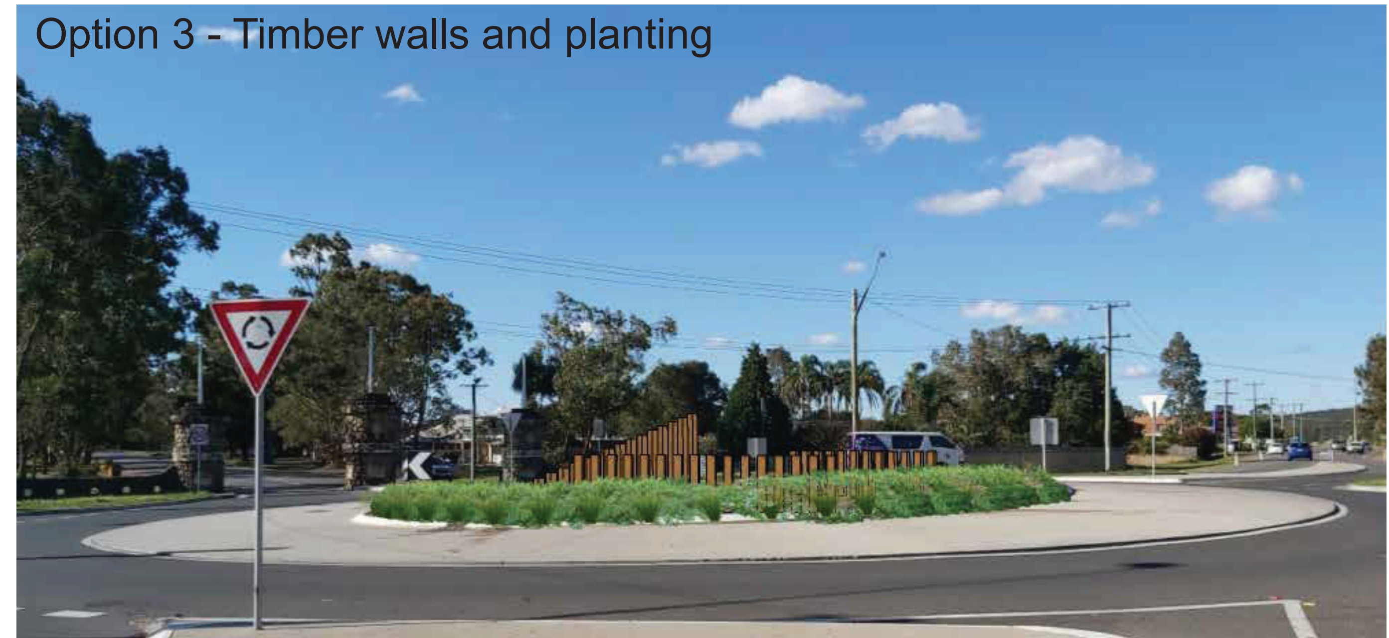
Ground level planting with drought tolerant vegetation and a low-key timber wall. Possible to include lettering on timberwork for a 'welcome' message.