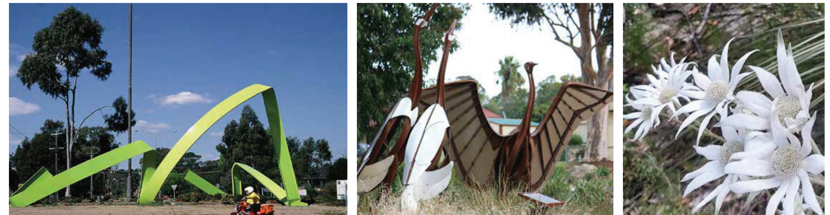
Precedent images showing public sculpture ideas and possible materials and themes.