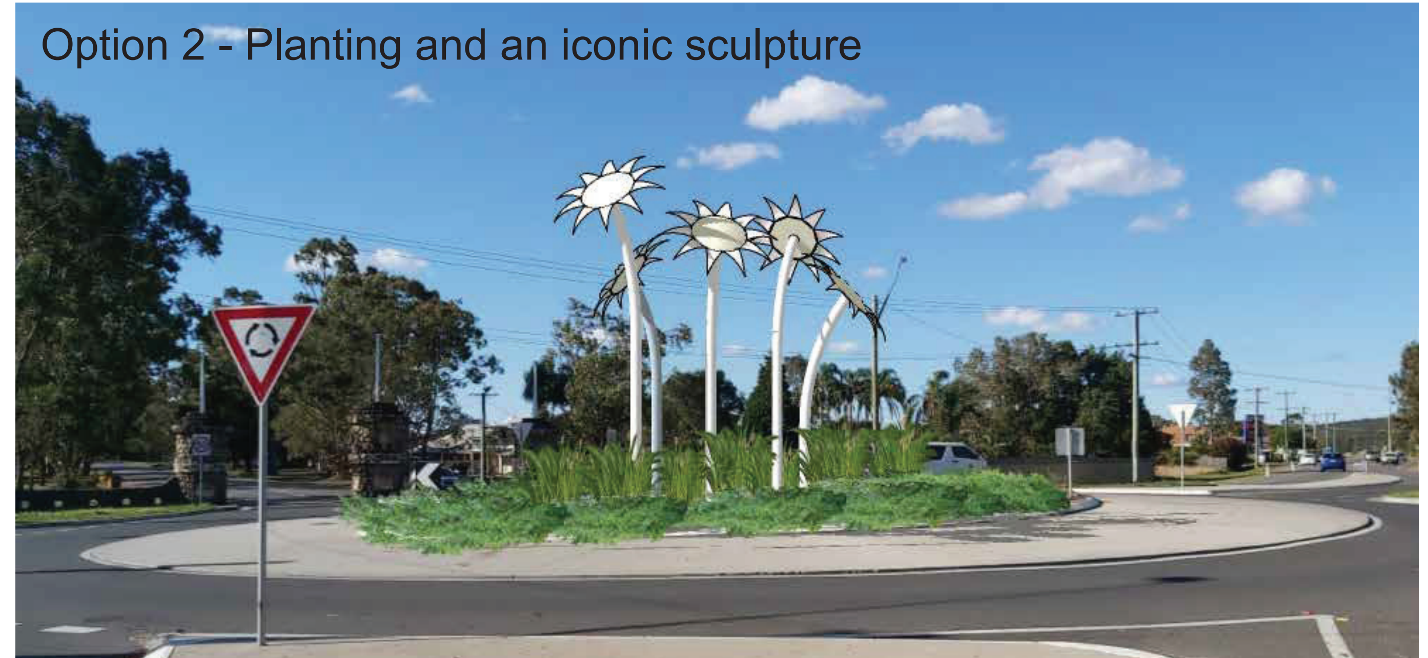
Ground level planting with drought tolerant vegetation. Substantial iconic sculpture by a local artists and fabricator (possibly of Flannel Flower (shown) dependant on fundraising.