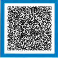
QR Code for Raymond Terrace Senior Citizens Hall