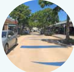
Road stamping in shared zones