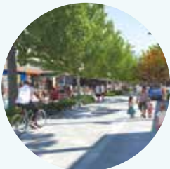
Pedestrian and cyclist friendly streets