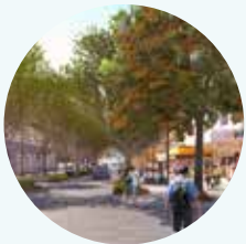
A greener town centre