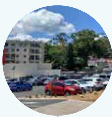
Donald Street East carpark