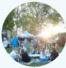
Spaces for people to enjoy that come alive