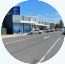
Extension of one-way on Stockton and Yacabaa streets