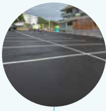
New and improved car parking