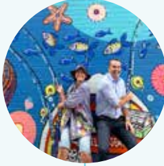
Beautification, including public art and fairy lighting

What's next? We're investigating the benefits of smart parking in other areas, including Birubi Beach and Shoal Bay.