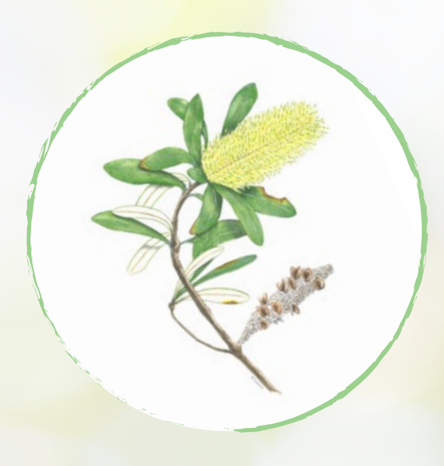
Coast banksia Banksia integrifolia