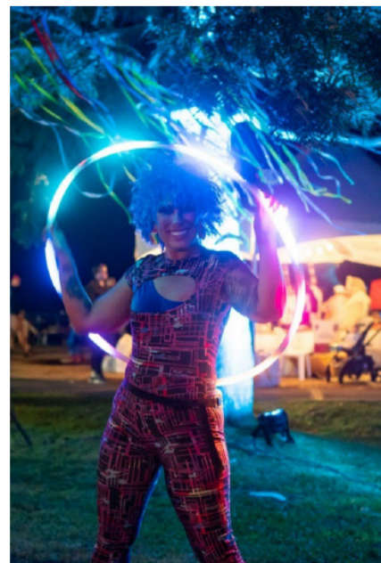
Karuah by Night

Following a challenging few years, events are returning to Port Stephens. Sail Port Stephens was held in April and May and is now the second largest Sailing Regatta in Australia. This year's event was extended to accommodate the demand for berthing and accommodation. Over 1000 people participated in the event which injects more than $1M into the Port Stephens economy.