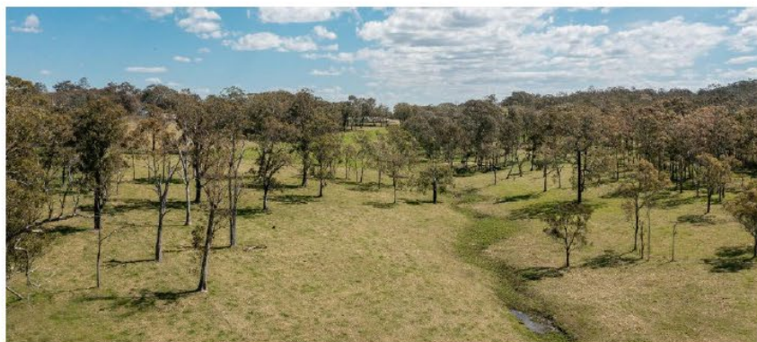
Community Engagement and Communications Plan 9