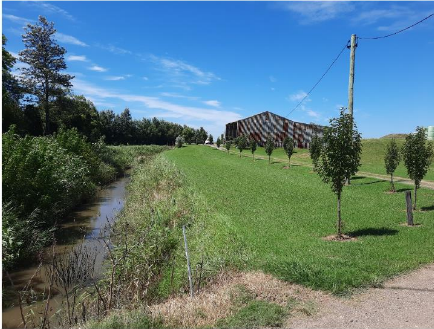
Figure 5: View of small creek that borders eastern section of the site