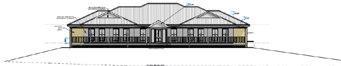
Figure 1: North-west elevation of proposed dwelling

The application seeks approval for construction of a dwelling on an existing earth mound located on the subject site. The proposal involves the construction of a single storey dwelling with a total roof area of 426m 2 . The dwelling is divided into areas of 292.54m 2 living area (four bedrooms, bathroom, powder room, ensuite, kitchen, living/dining area and lounge areas) and verandahs. The dwelling will be constructed on a concrete pad on top of an existing flood mound, at a level located above the site Flood Planning Level (FPL).