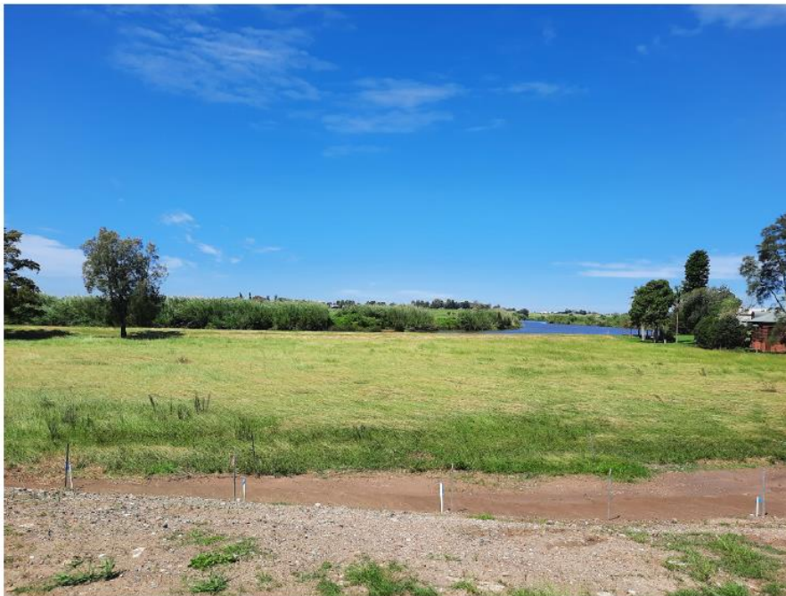
Figure 6: View to the east of the site, taken from earth mound