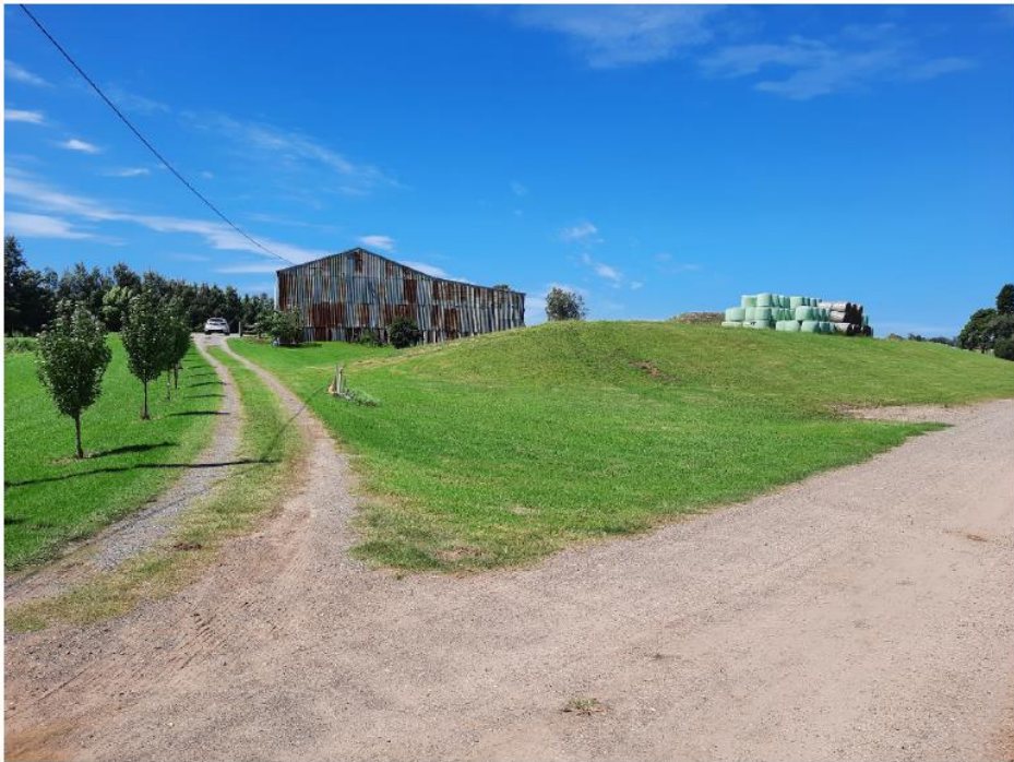
Figure 3: View of eastern section of the site, taken from driveway crossover