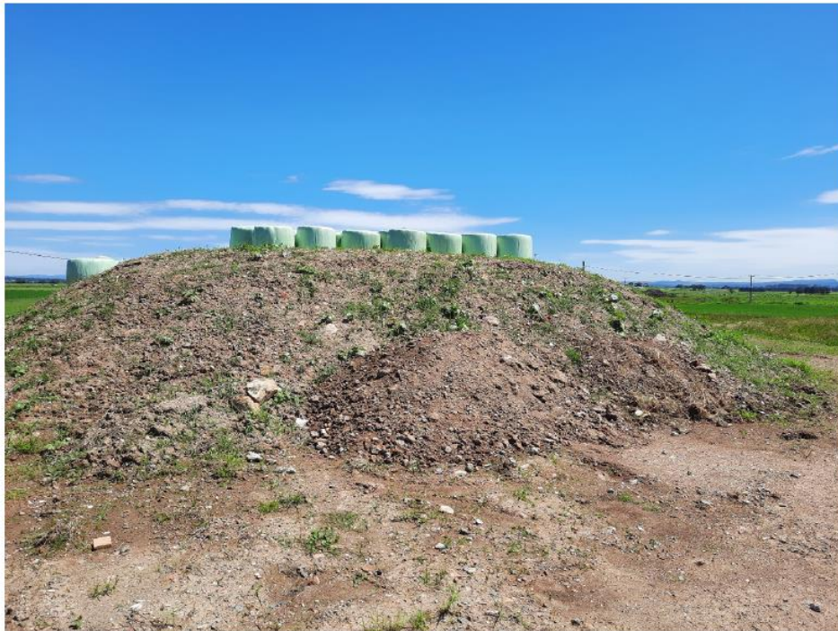
Figure 7: Additional fill to be compacted and levelled over earth mound