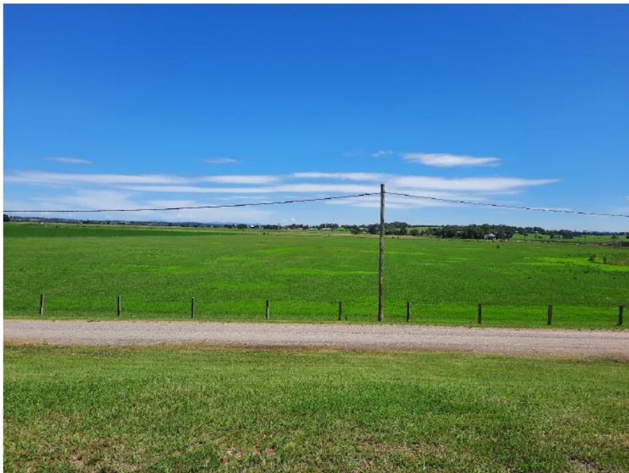
Figure 4: View of western section of the site, taken from earth mound