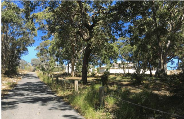
Image 2: Existing access to subject site and closest dwelling house to the right.