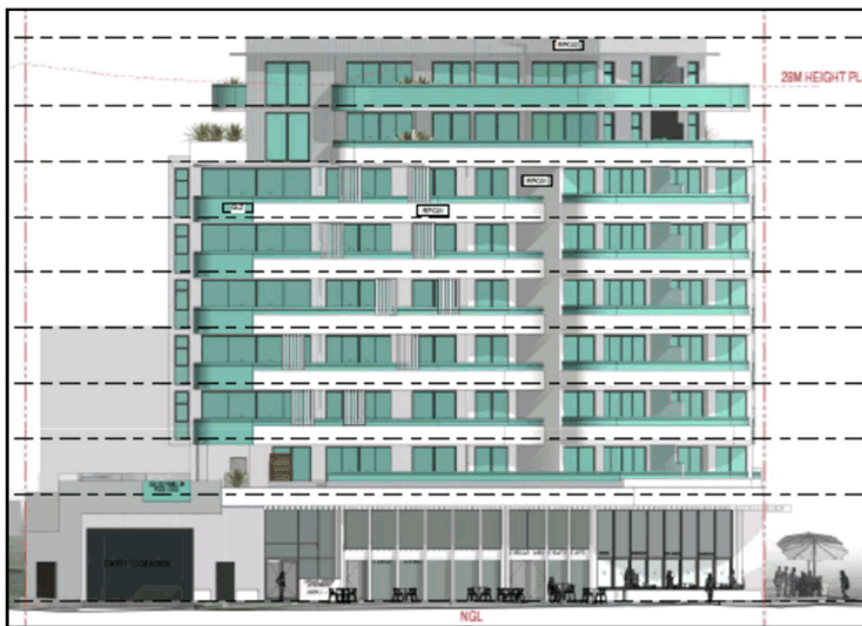
Figure 2: Donald Street elevation