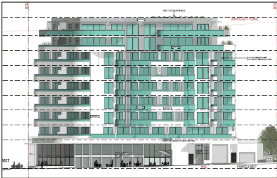
Figure 1: Yacaaba Street elevation

Residential and commercial waste storage areas have been provided within at ground floor level. Kerbside collection is proposed with all waste equipment movements to be managed by the building manager and /or cleaners.