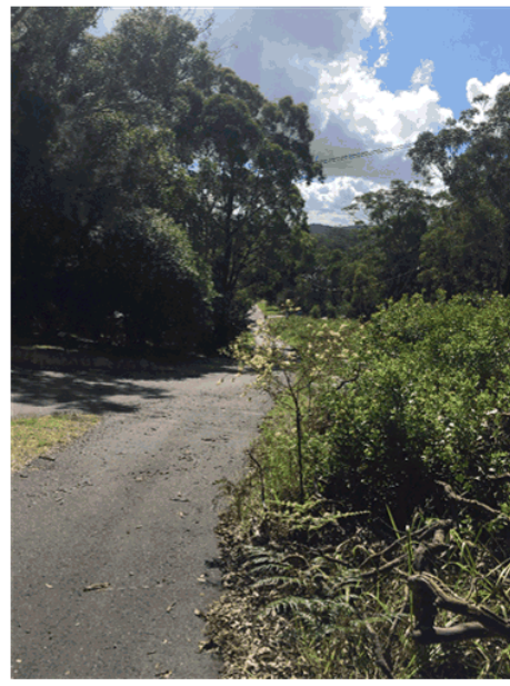
Image 4: Existing condition of Clark Street looking towards Gan Gan Road.