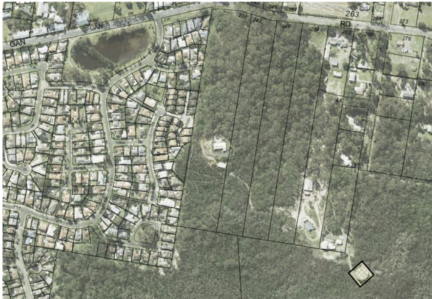
Figure 3: Locality plan of proposed development