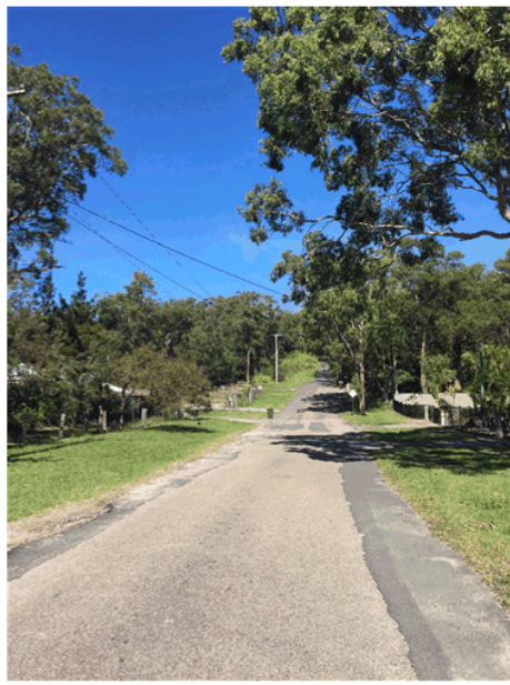
Image 3: Existing condition of Clark Street looking towards Gan Gan Road.