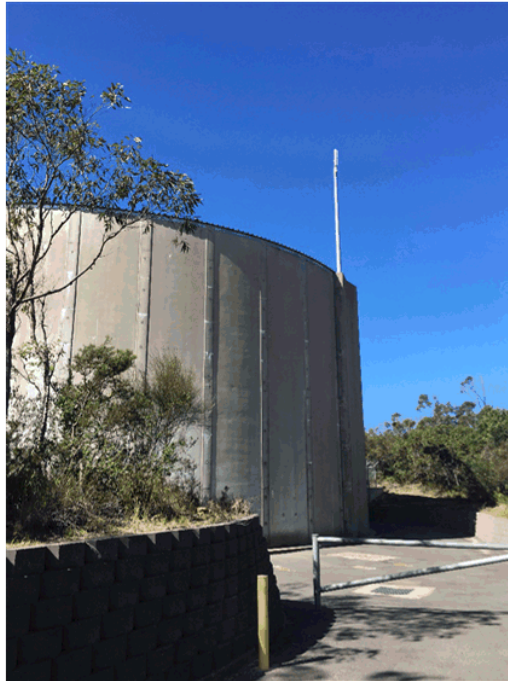
Image 5: Water reservoir and existing Freeview tower on subject site.