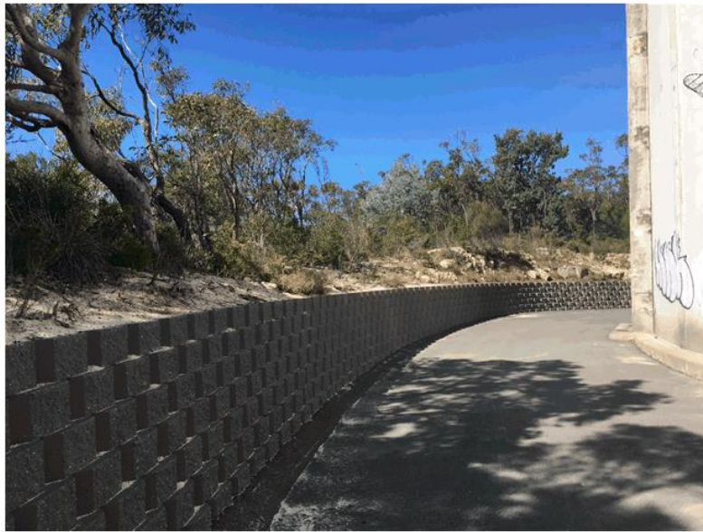
Image 6: Proposed compound area to the left, above the retaining wall.