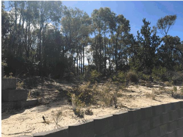
Image 7: Proposed compound area and adjoining Tomaree National Park.