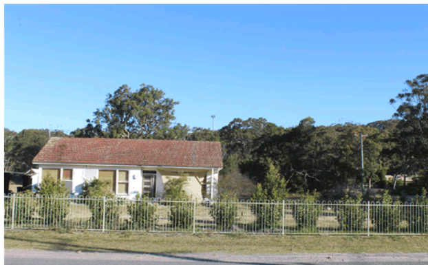
Figure 4: Photomontage of proposed development viewed from Gan Gan Rd

The height of the structure (28.5m) results in an inevitable visibility from Gan Gan Road and surrounds across Anna Bay and Boat Harbour. Due to the nature of telecommunications facilities, they must be located at an elevated position to gain the best coverage possible, which in turn results in potential negative visual impacts within the locality. Upon site inspection, it was noted that the proposed development may be visible from the immediately adjacent properties. However, given the design of the proposed structure, and being surrounded by bushland, the immediate visual impacts are not significantly intrusive. A photomontage is provided in Figure 4 to demonstrate the visual impact of the development from Gan Gan Road. As shown within this figure, the proposed development is integrated with the height of the predominant vegetation and interface with the skyline, and therefore does not dominate the skyline or reduce the quality of vistas. The overall scale and proportion is appropriate for the streetscape and setting and does not increase visual unsightliness or clutter. In addition, the proposed development is slim line and will be coloured grey and white in an effort to neutralise the facility and ensures integration with the existing environment.