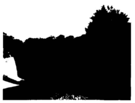
Water surrounding proposed club construction site