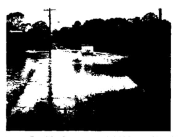
First vehicle to cross Ferodale after water receded. Yulong and Ferodale flooded

Attachment 3. Flooding of Ferodale/Yulong Ovals and Ferodale rd. This area is listed in the recent Medowie Flood Plain Strategy as the lowest point in the Medowie flood drainage basin. There are no short/medium term solution to alleviate flooding in this area.