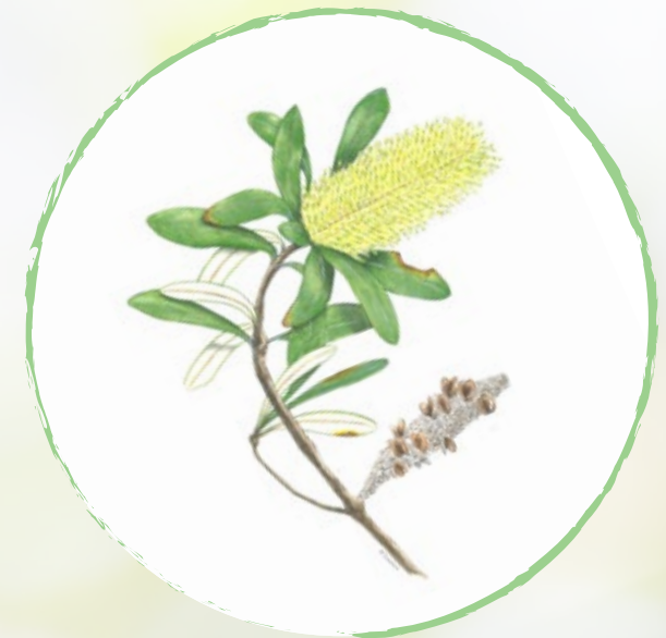
Coast banksia Banksia integrifolia