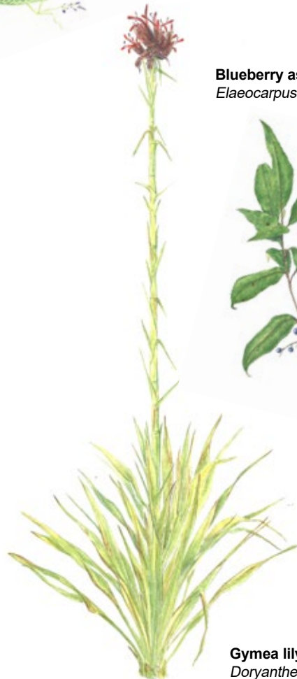
Gynea lily Doryanthes Excelsa