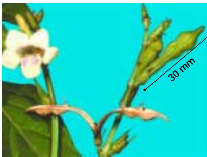
Flowers, leaves, and ripe and unripe seed capsules of A. gangetica ssp. micrantha .

The above contacts can offer advice on weed control in your state or territory. If using herbicides always read the label and follow instructions carefully. Particular care should be taken when using herbicides near waterways because rainfall running off the land into waterways can carry herbicides with it. Permits from state or territory Environment Protection Authorities may be required if herbicides are to be sprayed on riverbanks.