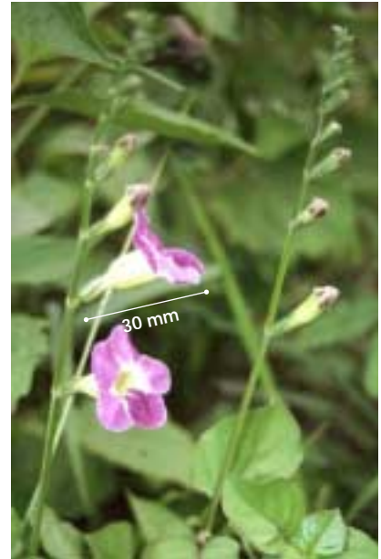
A. gangetica ssp. gangetica has purple flowers. It is naturalised across parts of northern Australia.

As with all weed management, prevention is better and more cost-effective than control. The annual cost of weeds to agriculture in Australia, in terms of decreased productivity and management costs, is conservatively estimated at $4 billion. Environmental impacts are also significant and lead to a loss of biodiversity. To limit escalation of these impacts, it is vital to prevent further introduction of new weed species, such as A. gangetica ssp. micrantha , into uninfested natural ecosystems.