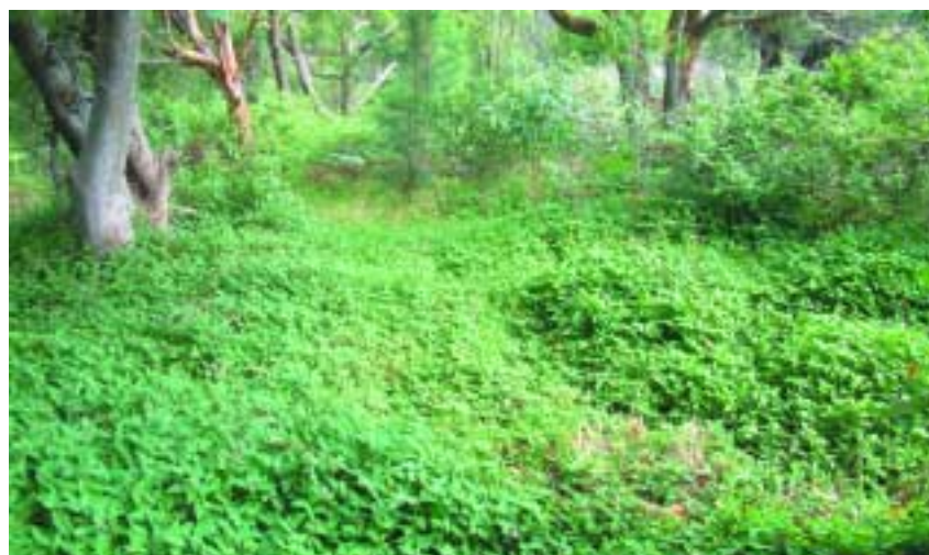
Most infestations north of Newcastle, NSW, occur on vacant residential land, along fencelines, and in abandoned flower beds and adjacent bushlands.

Both subspecies of A. gangetica are problem weeds throughout much of South-East Asia, including Malaysia, Indonesia, Papua New Guinea and the Pacific islands. They both grow widely as weeds in rubber, oil-palm, coffee and other crops, but A. gangetica ssp.